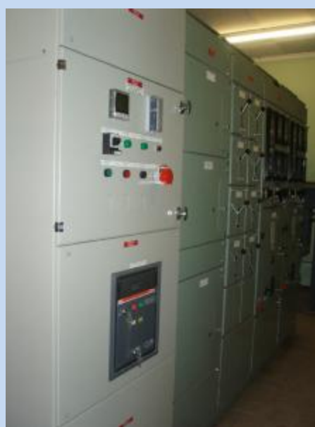
Ok, so it's the Wrong Colour... The existing MVAC switchboard built in 1978 extended with the new generator supply panel (they asked for the colour by the way...)

The overall design and build project package comprised the installation of the new Generator extension panel, trenching, ducting and re-surfacing of cable routes, the reconfiguration and extensive re-cabling of the existing generator changeover scheme, the removal of an old generating set, the replacement of an existing LV essential services switchboard and the re-cabling of the overall LV scheme to ensure the Generator supply covered all the 'essential' and 'non-essential' circuits.